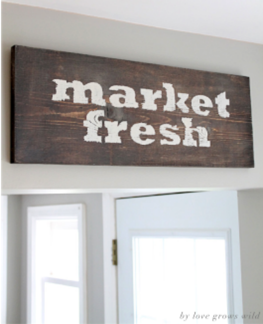
Market Fresh Kitchen Sign