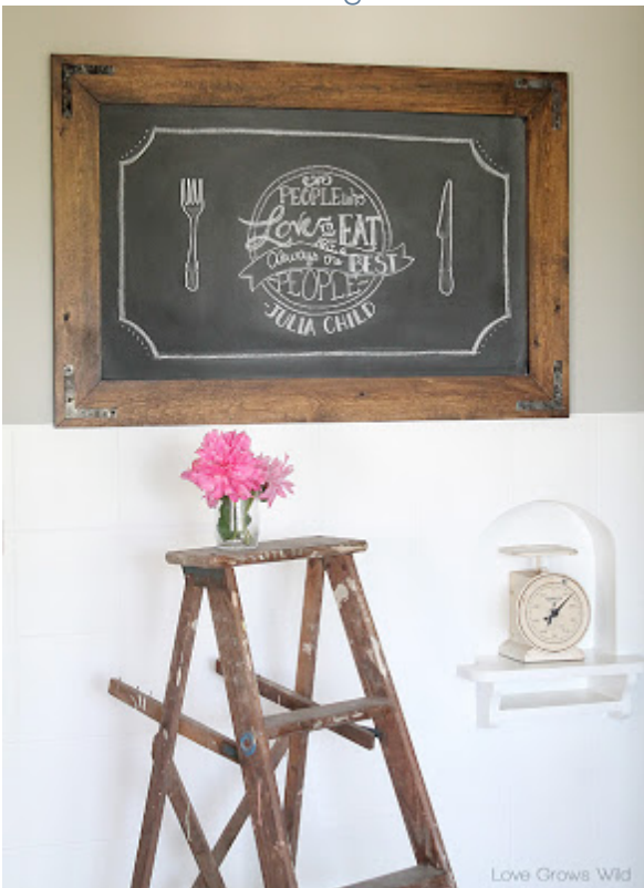
DIY Rustic Industrial Chalkboard Let's Keep In Touch!