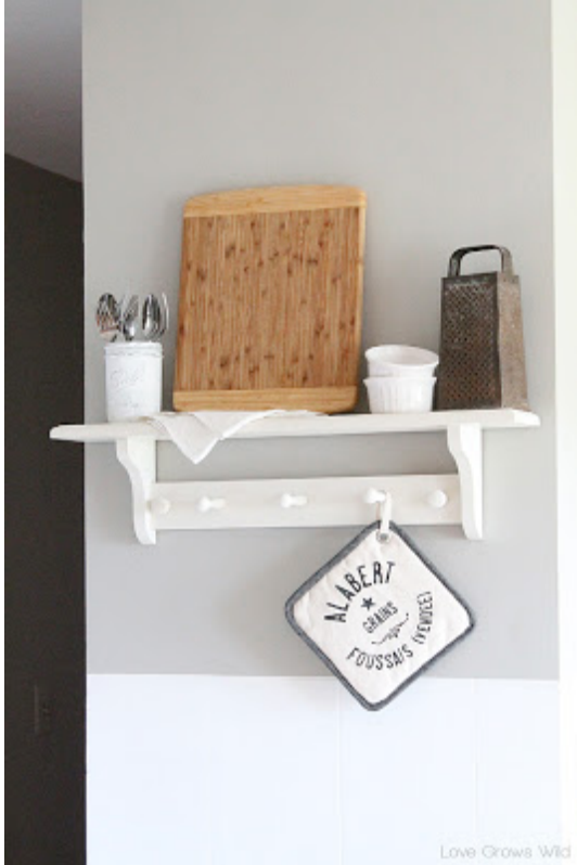
How to Decorate on a Budget