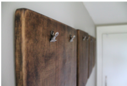
DIY Photo Clipboards